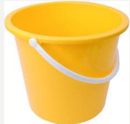
Special Ed. Funds (SWD)