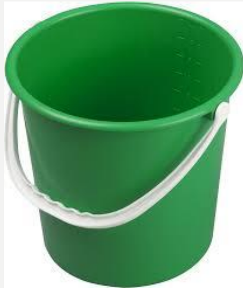
General Education Funds