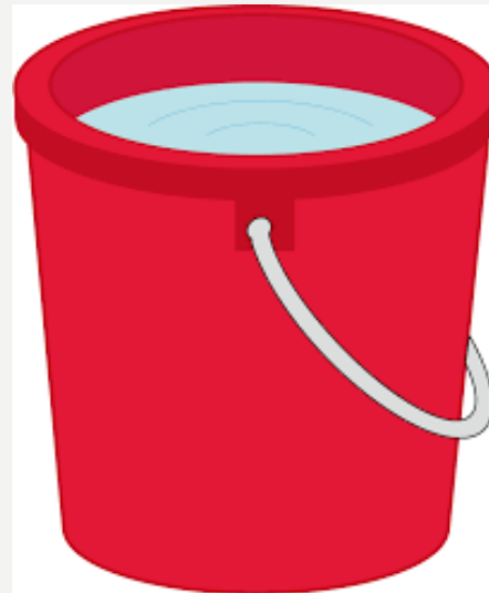
Grants, Targeted & Title I Funds